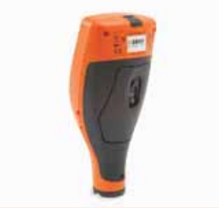
Ergonomic design for comfort during continuous use