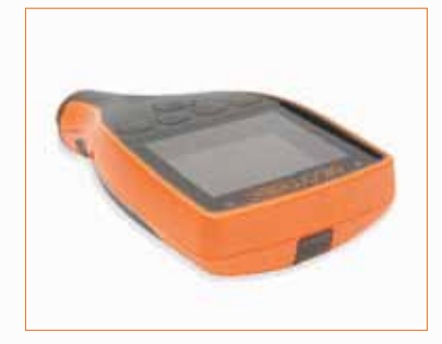
2.4" colour screen provides enhanced reading visibility at all angles