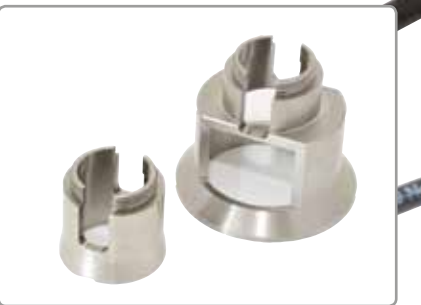
Actuator skirts for a range of substrate thicknesses and bond strengths, on flat or curved surfaces